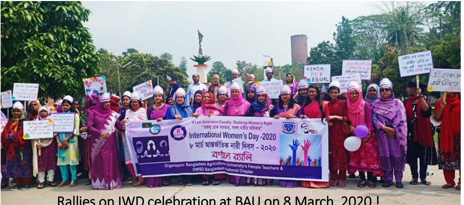
Rallies on IWD celebration at BAU on 8 March, 2020 !