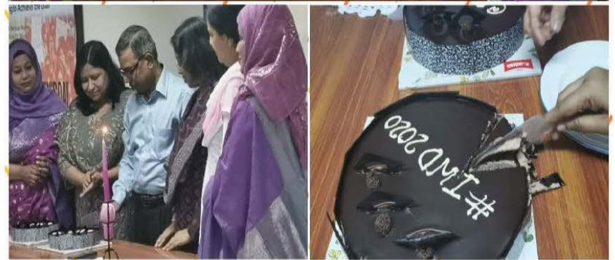
IWD celebration photos at AERE, BAEC on 8 March, 2020 !