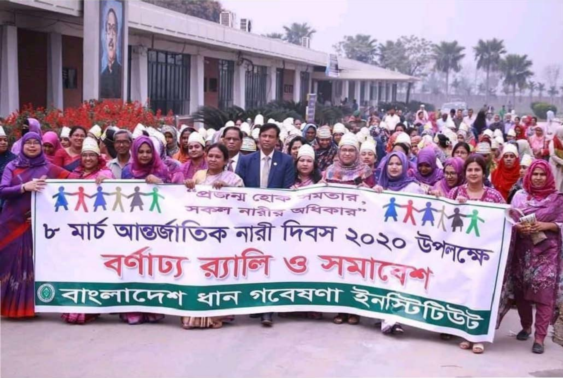
IWD celebration rally at BRRRI on 8 March, 2020 !