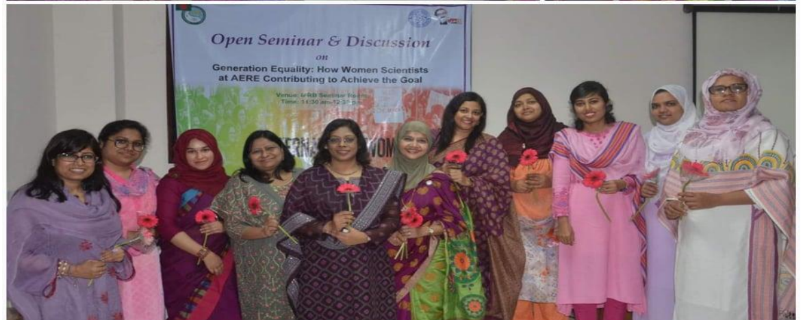
#EACHFOREQUAL pose and AERE scientists from different institutes celebrating #IWD2020