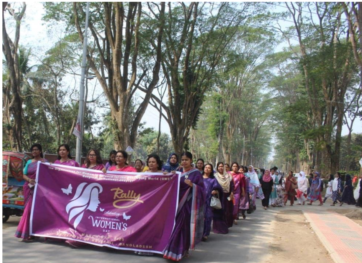
Rallies on IWD celebration at RU on 8 March, 2020 !