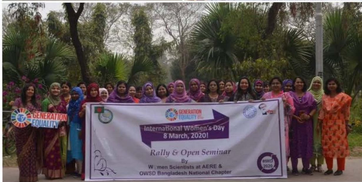
Rallies on IWD celebration at AERE, BAEC on 8 March, 2020 !