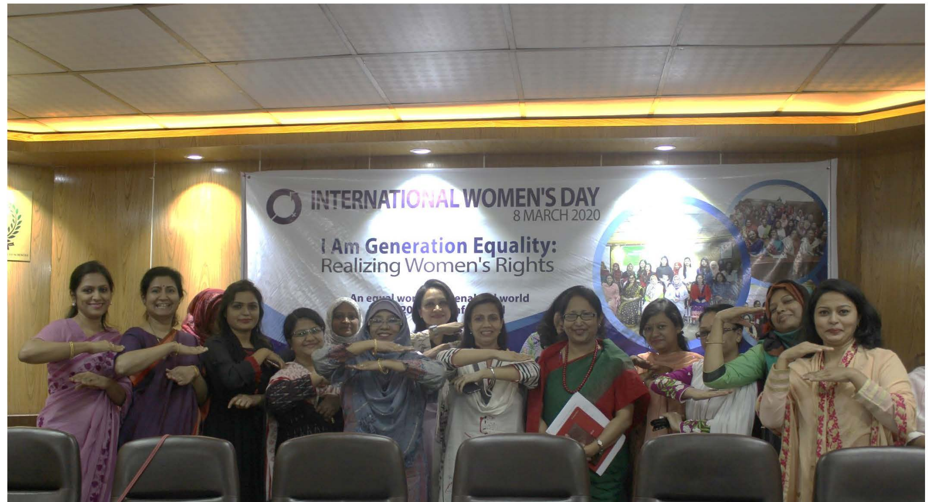
BUHS Professionals posing #EACHFOREQUAL on 8 March, 2020 !