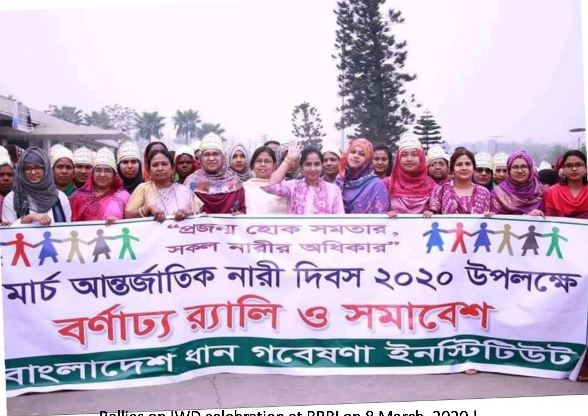
Rallies on IWD celebration at BRRI on 8 March, 2020 !