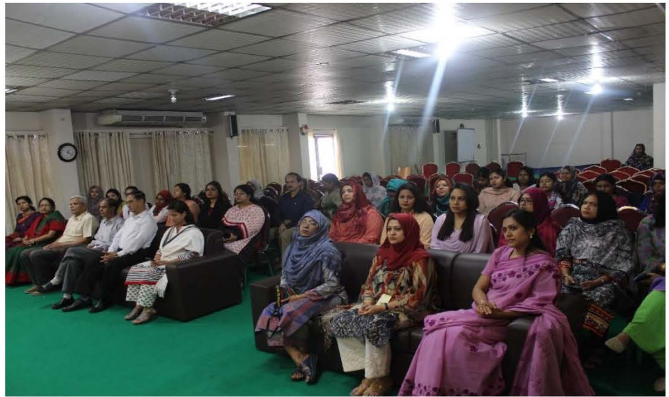
Seminar at BUHS on IWD celebration, 8 March, 2020 !