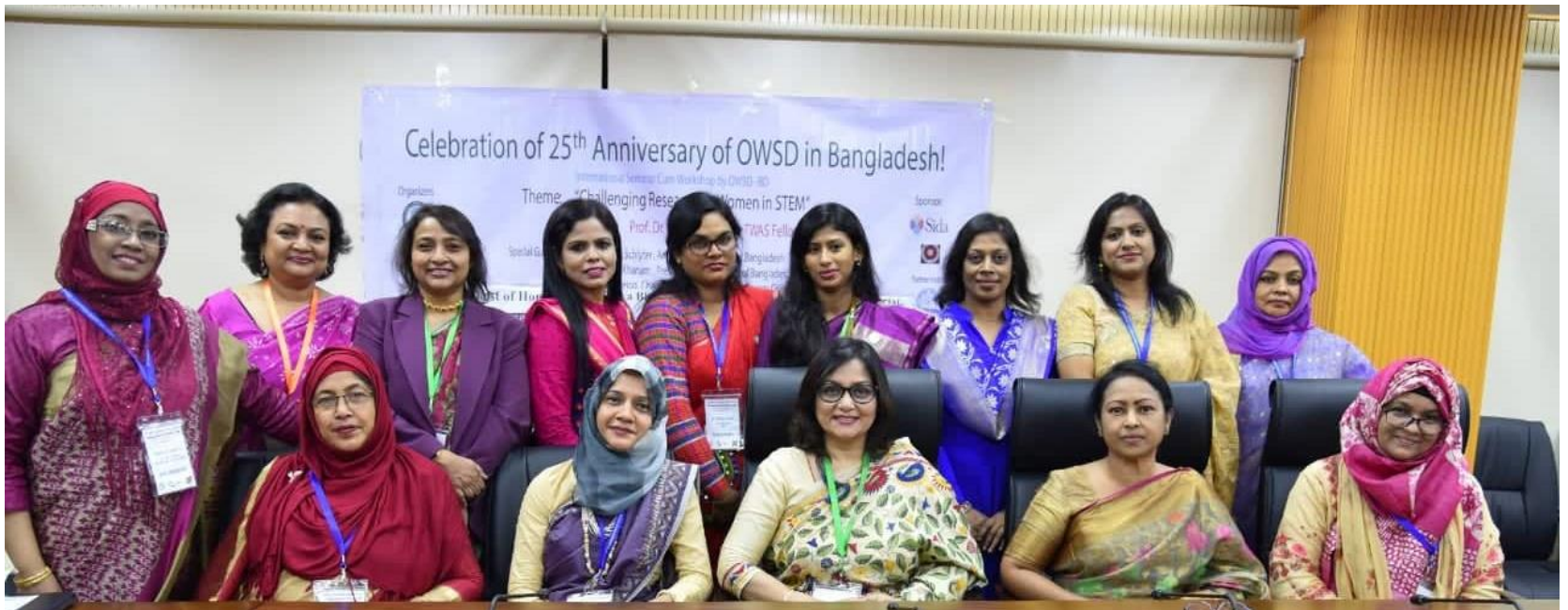
OWSD Bangladesh National Chapter Executive Committee FY 2019-2020 !