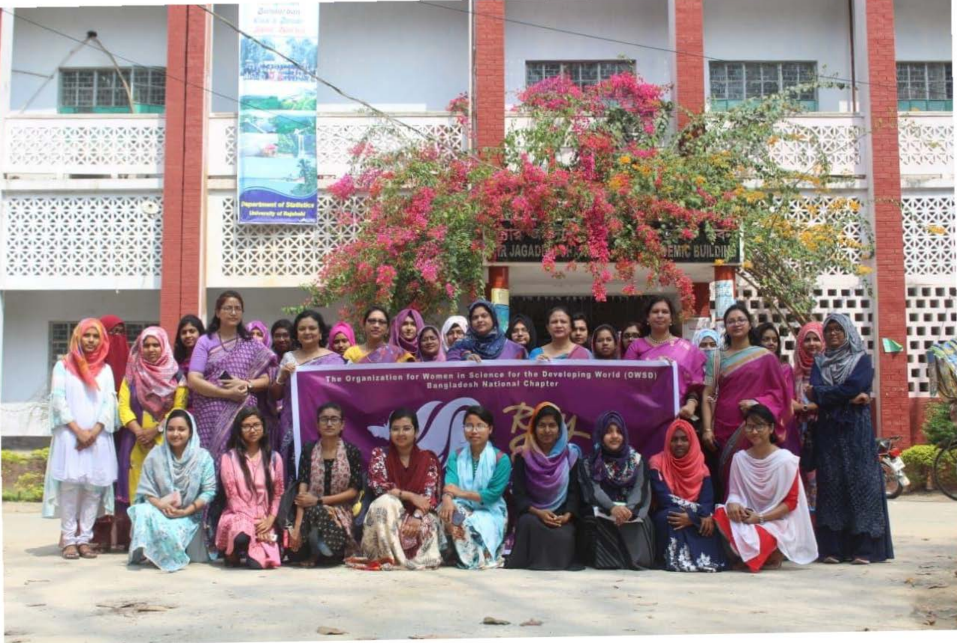
IWD celebration photos at Rajshahi University, Bangladesh on 8 March, 2020 !