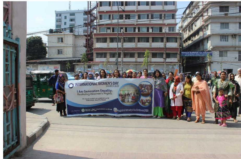
Rallies on IWD celebration at BUHS on 8 March, 2020 !