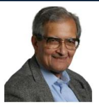
Amartya Sen, Harvard University, USA